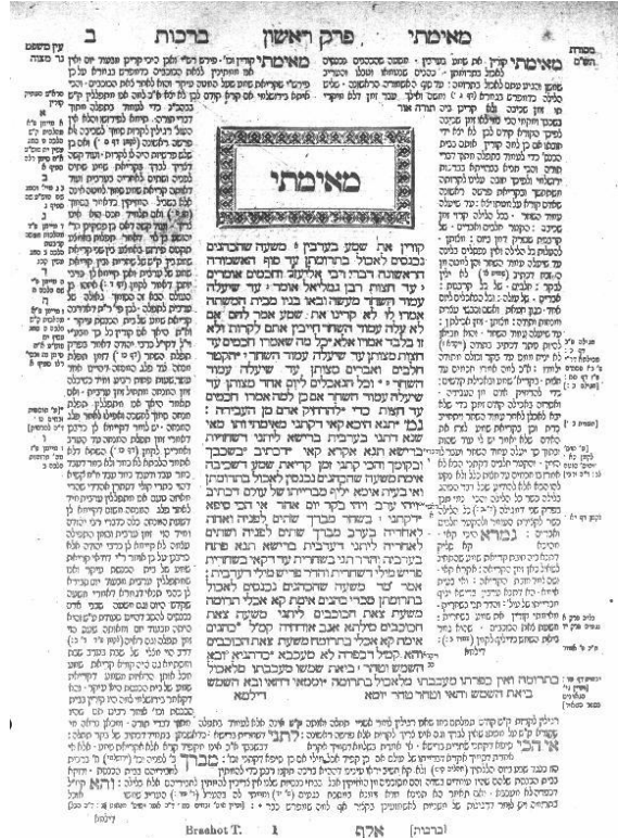
The first page of the Vilna Edition of the Babylonian Talmud, Tractate Berachot, folio 2a.

Originally, Jewish scholarship was oral. Rabbis expounded and debated the Torah (the written Torah expressed in the Hebrew Bible) and discussed the Tanakh without the benefit of written works (other than the Biblical books themselves), though some may have made private notes ( setarim megillot ), for example of court decisions. This situation changed drastically, mainly as the result of the destruction of the Jewish commonwealth and the Second Temple in the year 70 CE and the consequent upheaval of Jewish social and legal norms. As the Rabbis were required to face a new reality—mainly Judaism without a Temple (to serve as the center of teaching and study) and Judea without at least partial autonomy—there