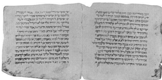
A page of a medieval Jerusalem Talmud manuscript, from the Cairo Genizah.

The Jerusalem Talmud was one of the two compilations